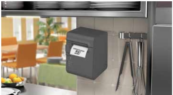
Client printer in kitchen prints order information for food preparation