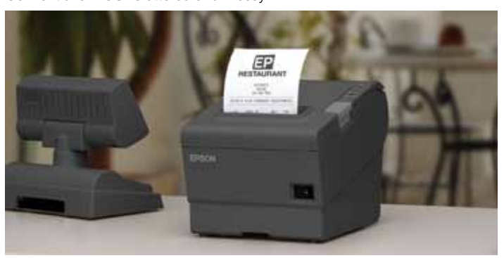
Epson TM-i POS: Neat, mobile and compact