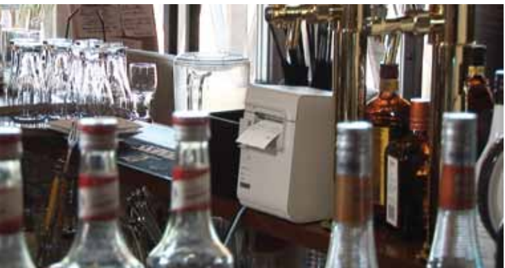
Client printer at bar prints drink orders for drink preparation