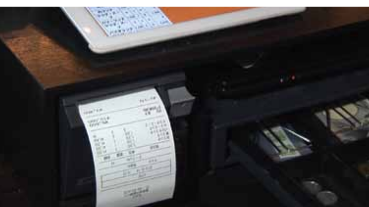
Epson TM-i at cashier counter acts as a printer hub and prints final receipt