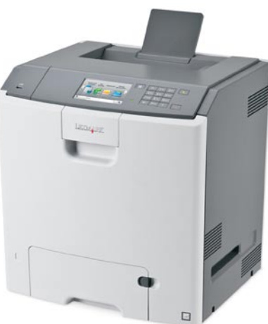
4.3-in. Touch Up to 35 ppm