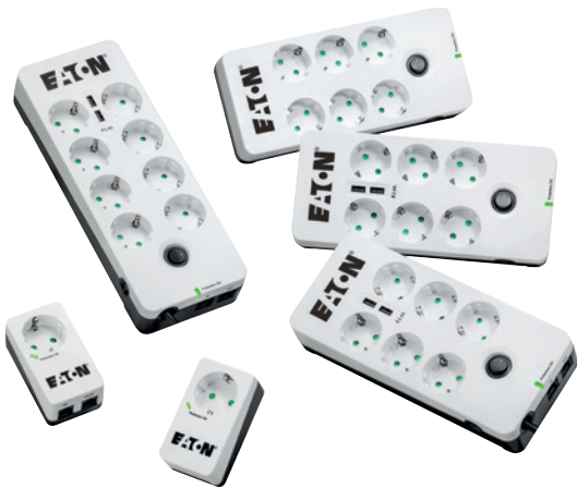
Eaton Protection Box range