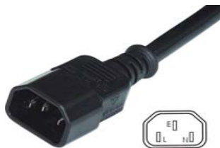
IEC320 C14 10A plug