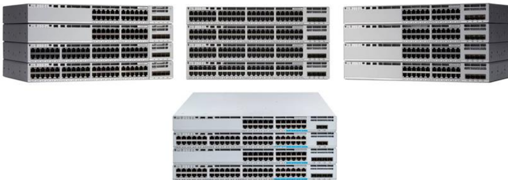
Figure 1. Cisco Catalyst 9200 Series switches

The Cisco Catalyst 9200 Series is made up of modular (C9200) and fixed (C9200L) switch models.