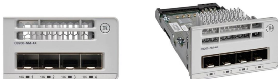
Figure 2. Cisco Catalyst 9200 Series Switch network modules

Cisco Catalyst 9200 Series switches come with modular or fixed uplinks as indicated in Table 1. With modular SKUs, the field-replaceable network modules provide infrastructure investment protection by allowing a nondisruptive migration from 1G to 10G and beyond. When you purchase the switch, you can choose from the network modules described in Table 2.