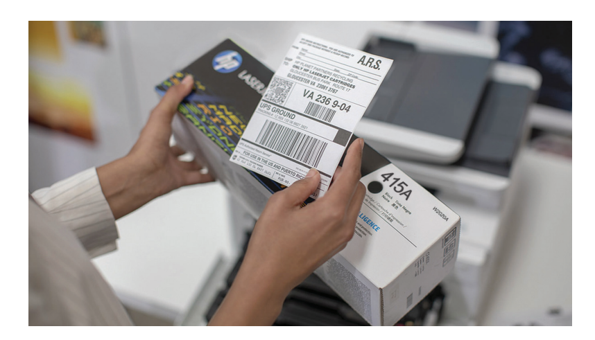
Find out more about HP Planet Partners<sup>25</sup> at hp.com/recycle

Count on easy cartridge recycling at no additional charge with HP Planet Partners.<sup>25</sup>