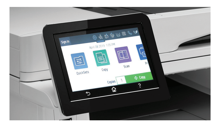
Customise frequently used tasks with Quick Sets feature<sup>3</sup>

Speed through print jobs right out of the box. This printer is shipped with preinstalled, specially designed Original HP LaserJet toner cartridges with JetIntelligence. Auto seal removal enables simple and seamless cartridge replacement, so you can get back to business fast—without costly delays or frustrating messes.