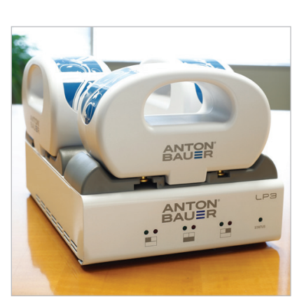
ELORA DESKTOP CHARGER 98-004