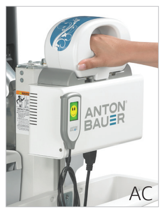
SV Hot Swap Power System