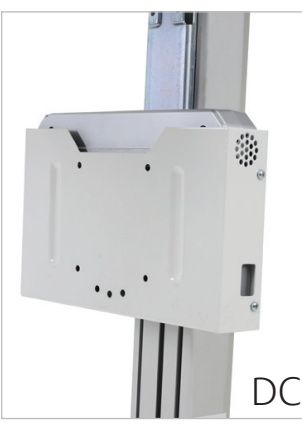
SV DC Power System