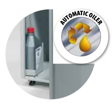
AUTOMATIC OILER - AO Built-in automatic oiling system which eliminates the need for manual oiling of cutting knives.