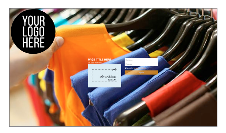
Figure 3: Customizable guest login page

Customize and simplify visitor access with fully secure and scalable guest Wi-Fi solution. Create log-in portals in minutes for all of your locations that includes your branding with logo, colors, terms and conditions, and more.