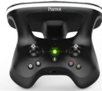
Parrot SKYCONTROLLER 2

Meet Parrot Skycontroller 2, the long-range compact controller to enjoy your flights with precise piloting controls: