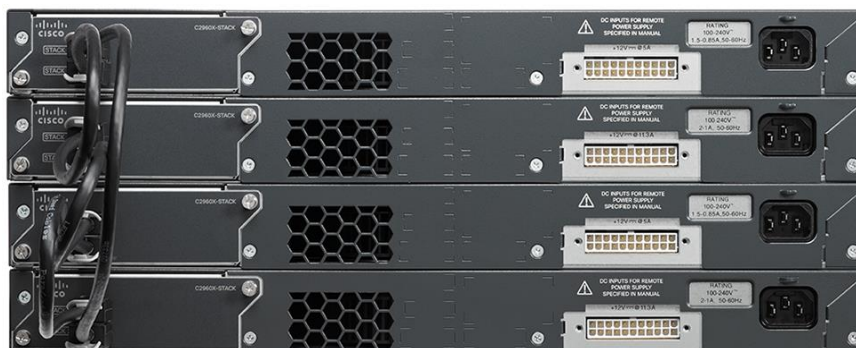
Figure 2. Cisco FlexStack-Plus Switch Stack