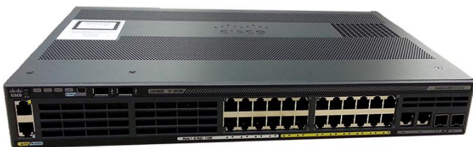
Figure 4. Fanless Quiet Cool 24-Port PoE Switch

The Cisco Catalyst 2960-X Series adds a new member to its 2960-X family, the WS-C2960X-24PSQ-L (Cool). This is a 24-port 10M/100M/1000M switch that can power up to 8 ports of PoE (first eight ports only) with ability to deliver a sum total of 110W of PoE power. This switch has four Gigabit Ethernet uplinks: two of them SFP and the other two 10M/100M/1000M copper interfaces enabling choice of fiber or copper connectivity to the aggregation point. This switch ships with the Cisco IOS LAN Base image.