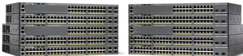
Figure 1. A Cisco Catalyst 2960-X Series Switch Family

Cisco® Catalyst® 2960-X Series Switches are fixed-configuration, stackable Gigabit Ethernet switches that provide enterprise-class access for campus and branch applications (Figure 1). Designed for operational simplicity to lower total cost of ownership, they enable scalable, secure and energy-efficient business operations with intelligent services and a range of advanced Cisco IOS® Software features.