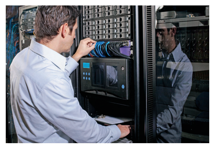
Belkin's high-performance rails do not require any additional release springs, providing IT administrators with a truly hassle-free operation.

You can trust Belkin to help you get your job done—faster and simpler. Belkin 19-inch Widescreen Rack Consoles install in a fraction of the time and effort as other rackmount consoles, thanks to hassle-free innovations such as screwless rail design, adjustable rails, and a lighter, slimmer build. It's also compatible with multiple cabinet and system configurations, and does not require a bracket configuration.