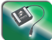
USB Plus Series