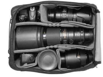
full-frame DSLR, 1 super telephoto lens, 3 more lenses + battery grip