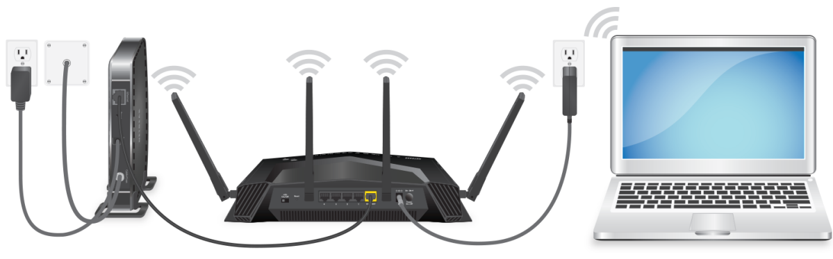
Figure 7. Cable your router

Power on your router and connect it to a modem.