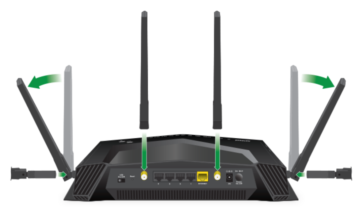
Figure 4. Attach the antennas and position them for best WiFi performance

The router comes with four antennas. Attach two antennas to the rear panel and attach one antenna to each side panel.