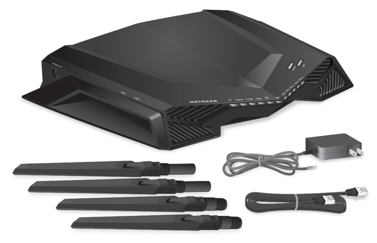
Figure 1. Package contents

Your package contains the Nighthawk Pro Gaming Router, the four antennas, the power adapter, and an Ethernet cable.