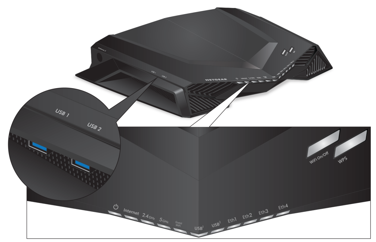
Figure 2. Front view

The status LEDs are located on the front panel, two buttons with LEDs are located on the top panel, and two USB 3.0 ports are located on the left side panel of the router.