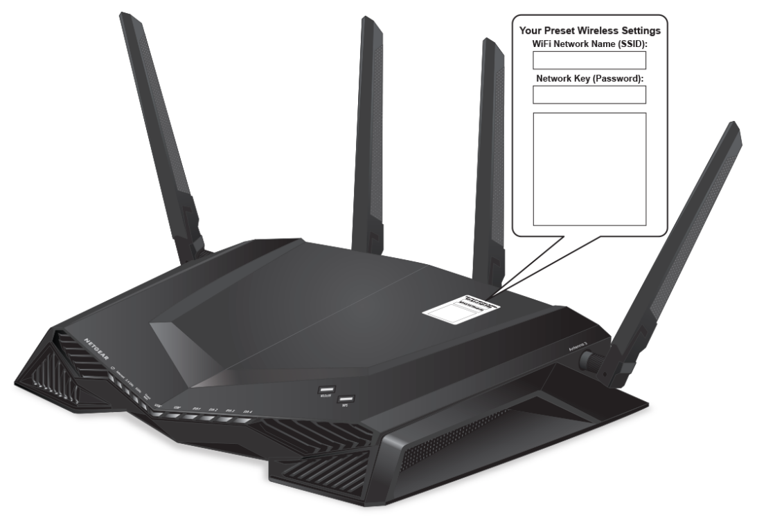
Figure 6. Location of the router label