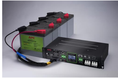
SecureUPS On-Line 120V AC output, 1300VA

For low voltage advanced transportation control (ATC) cabinet