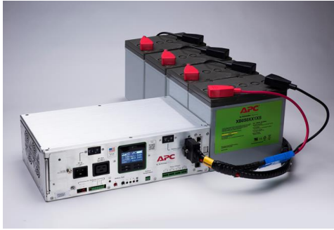
SecureUPS On-Line 120V AC & 48V, 24V DC output

For low voltage advanced transportation control (ATC) cabinet