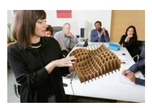
For razor sharp close-ups, the GROUP camera offers 10x lossless zoom enabling your team to see every detail with outstanding resolution and clarity.

GROUP offers the flexibility to customize conference room set-up with multiple camera mounting options. Use the camera on the table or mount it on the wall with included hardware. The bottom of the camera has a standard tripod thread for added versatility. Conference participants can clearly converse within a 6m/20-foot diameter around the base, or extend the range to 8.5m/28-foot with optional expansion mics.