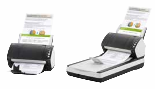
fi-7140 / fi-7240 – A4 Portrait at 300 dpi 40 ppm / 80 ipm Scan mixed batches up to 80 sheets