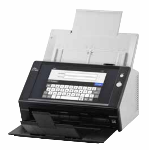
A4 Portrait at 300 dpi 25 ppm / 50 ipm Scan mixed batches up to 50 sheets