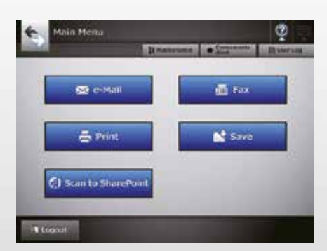
Main Menu screen