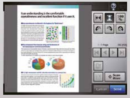
Preview screen (Scan viewer)