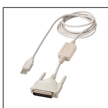
Easily connect your computer's USB port to a serial modem with a USR995700-USB Serial-to- USB Cable