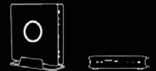
Stand Upright or Lay Flat

ZOTAC ZBOX can be a stand-alone miniature solution.