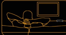
In your living room...