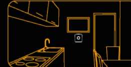
In your kitchen...