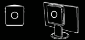
Wall mount or LCD mount

ZOTAC ZBOX can also be mounted using the bundled VESA mount.