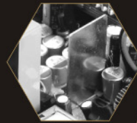
High Quality 105°C Cap