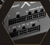
Patented DC connector Module