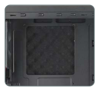
CPU retaining hole for easy customizability