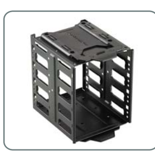
Removable HDD cage