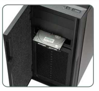
External SATA X-dock