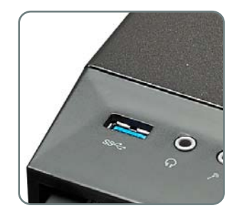
USB 3.0 (USB 2.0 backwards compatibility)