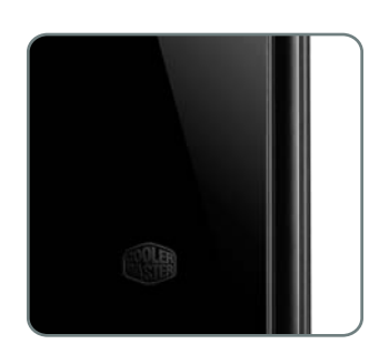
Mirror Finish Front Panel