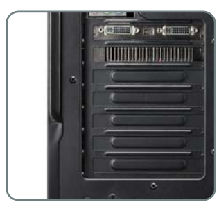
7 expansion slots