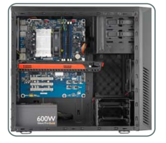
Supports Long VGA such as AMD HD 6990 and NVIDIA GTX 590 (without HDD cage)