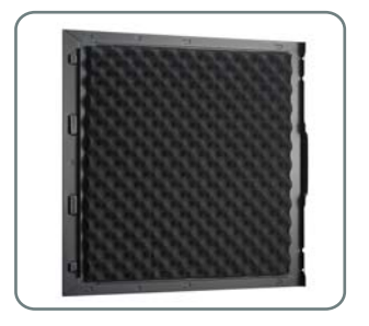
Side panel and front door with sound proofing