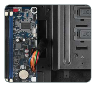
Improved cable management