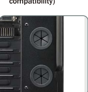
Rear retaining hole for water cooling kit