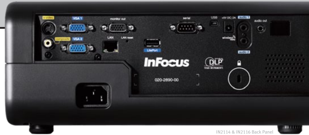
IN2114 & IN2116 Back Panel