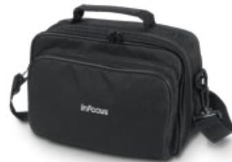
Padded carrying case is included

WXGA resolution and an HDMI connection are must-haves for displaying HD content. The InFocus IN1112 model has native WXGA resolution, so your audience will see your widescreen laptop as you intend, without scaling.