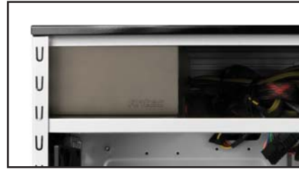
Included 620 watt power supply