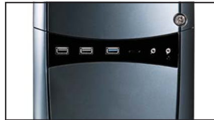
Front mounted I/O ports allows easy access for USB 2.0 and 3.0 and audio jacks