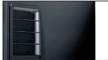
Washable air filters helps reduce dust buildup