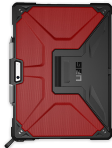
MAGMA SKU // 321786119393 UPC // 812451033342