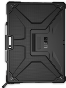
BLACK SKU // 321786114040 UPC // 812451033328