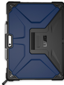
COBALT SKU // 321786115050 UPC // 812451033335