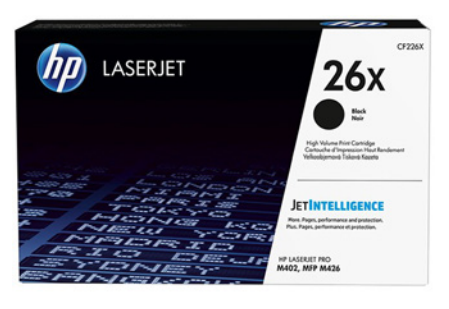
Original HP Toner cartridge with JetIntelligence

Bring out the best in your printer. Print more consistent, high-quality pages than ever before,<sup>1</sup> using specially designed Original HP Toner cartridges with JetIntelligence. Count on better performance, higher energy efficiency, and the authentic HP quality you paid for—something the competition simply can't match.<sup>1</sup>