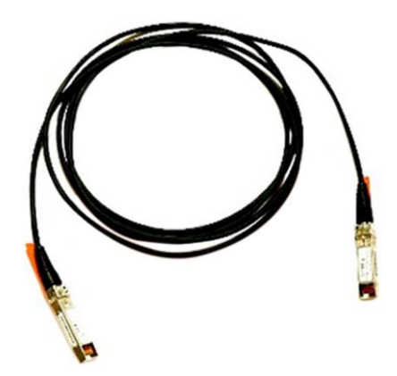
Figure 3. Cisco Direct-Attach Twinax Copper Cable Assembly with SFP+ Connectors