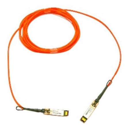
Figure 4. Cisco Direct-Attach Active Optical Cables with SFP+ Connectors

Cisco SFP+ Active Optical Cables (Figure 4) are direct-attach fiber assemblies with SFP+ connectors. They are suitable for very short distances and offer a cost-effective way to connect within racks and across adjacent racks. Cisco offers Active Optical Cables in lengths of 1, 2, 3, 5, 7, and 10 meters.