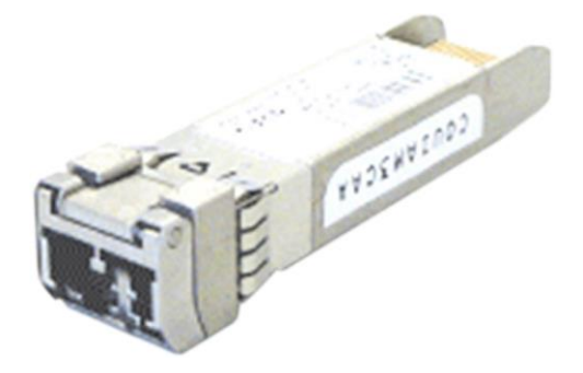
Figure 1. Cisco 10GBASE SFP+ Modules

The Cisco<sup>®</sup> 10GBASE SFP+ modules (Figure 1) give you a wide variety of 10 Gigabit Ethernet connectivity options for data center, enterprise wiring closet, and service provider transport applications.