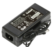
28 V 2.57 A power adapter (PoE version)