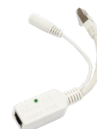
Gigabit PoE injector