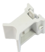
Pole mount bracket