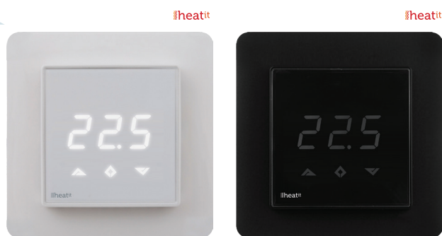
HEATIT Z-THERM2 White RAL 9003