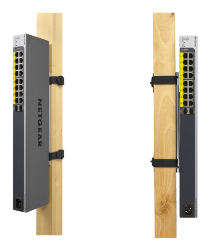
Secure placement is facilitated above drop-down ceilings, in air passageways and where other switches will not go, vertical or horizontal, flat or perpendicular.