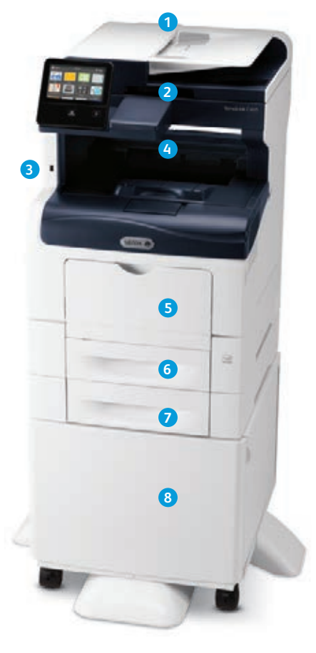
Xerox<sup>®</sup> VersaLink<sup>®</sup> C405 Colour Multifunction Printer Print. Copy. Scan. Fax. Email.