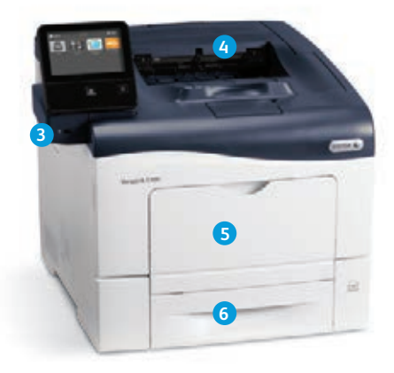
Xerox® VersaLink® C400 Colour Printer Print.