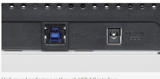
High speed performance through USB 3.0 interface