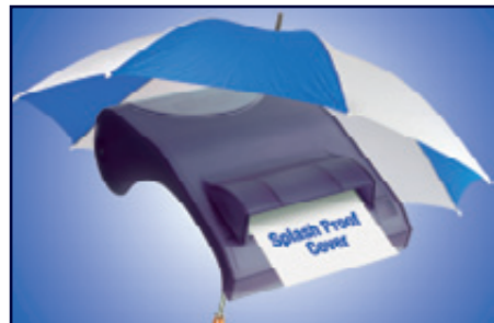
Splash Proof Cover – due January 2008