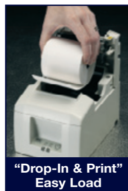
"Drop-In & Print" Easy Load