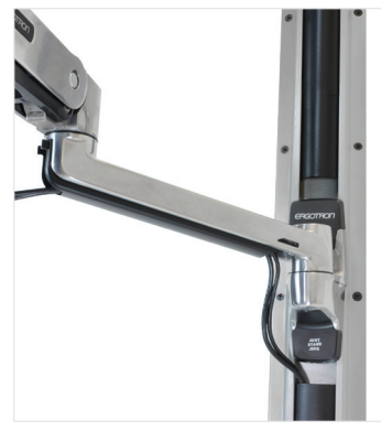
RECOMMENDED: ATTACH WALL MOUNT ARM TO AN ERGOTRON WALL TRACK USING BRACKET (97-091)