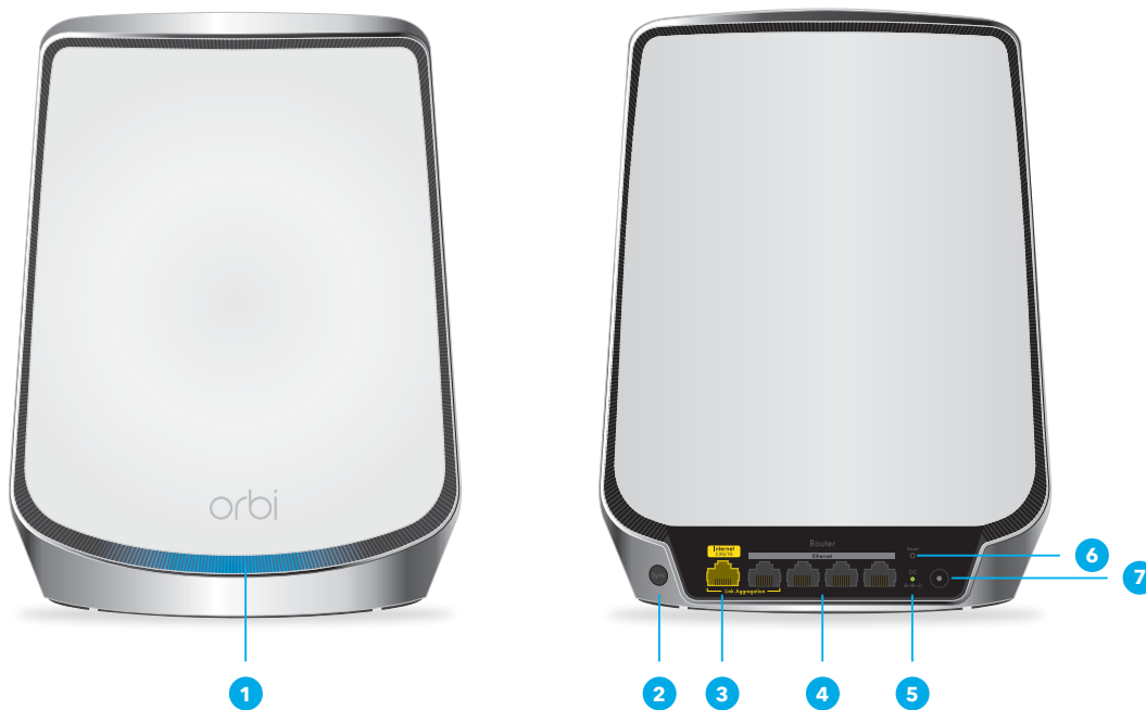
Figure 1. Orbi router front and back views

The following figures shows the Orbi router hardware features.