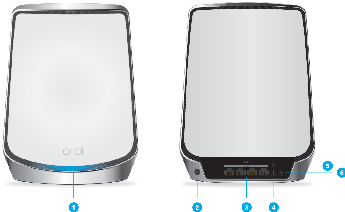
Figure 2. Orbi satellite front and back views

The following figures shows the Orbi satellite hardware features.