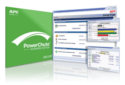
PowerChute Business Edition