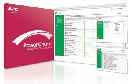
PowerChute Network Shutdown