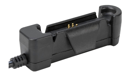
DuraCase Charging Adapter