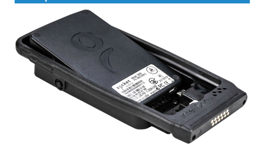
Step 1: Insert scanner into DuraCase

Caution: *DO NOT BEND the mobile device or barcode scanner forward. DO NOT BEND the connectors. *On Samsung mobile devices, be sure to disable Fast Charge.