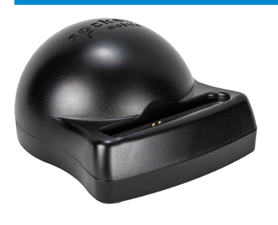
DuraCase Charging Dock