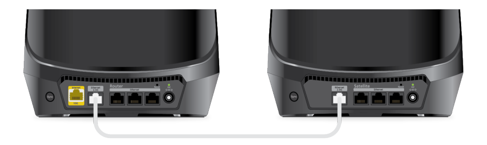
Figure 3. Satellite 2.5G Ethernet port connected to the router 2.5G Ethernet port

To set up an Ethernet backhaul connection, connect the 2.5G Ethernet port on the satellite to the 2.5G Ethernet port on the router with an Ethernet cable.