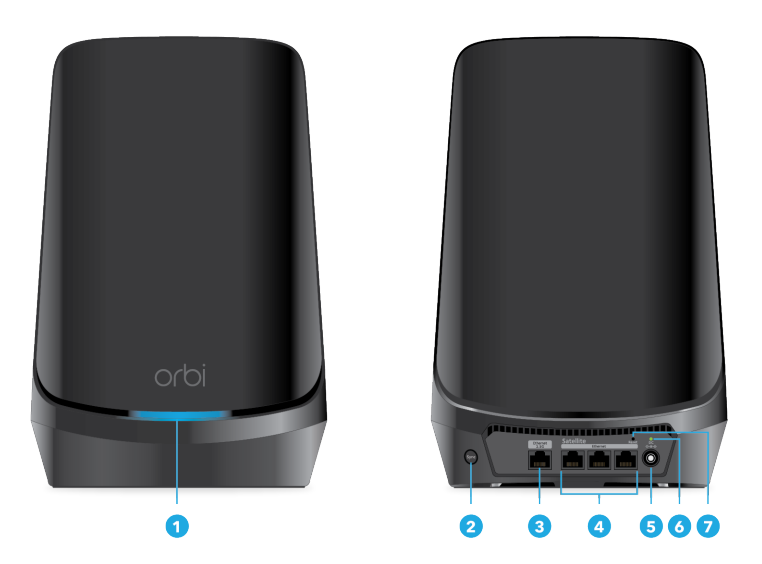
Figure 2. Orbi satellite front and back views

The following figures shows the Orbi satellite hardware features.