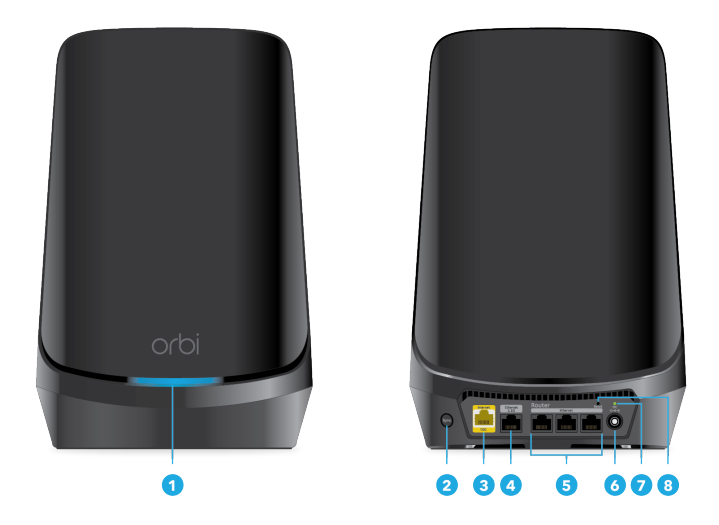
Figure 1. Orbi router front and back views

The following figures shows the Orbi router hardware features.