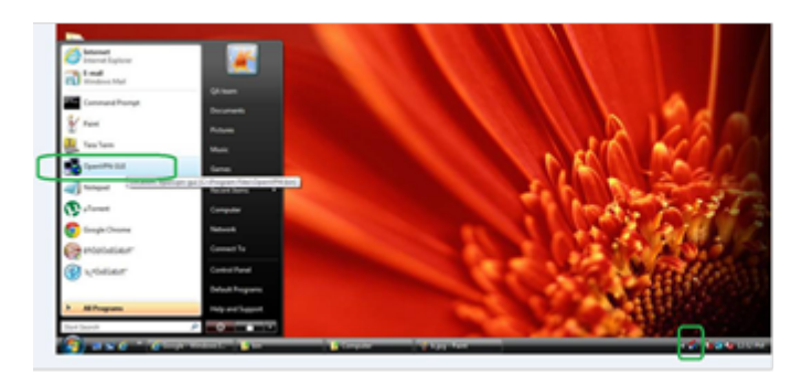
Figure 4. The OpenVPN icon displays in the Windows taskbar.

1. Launch the OpenVPN application with administrator privileges.