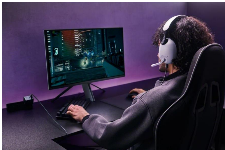
Play while charging