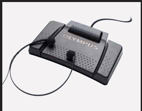
AS-9000 includes RS-31H, E-102, ODMS Transcription Module (Single License)

ODMS Transcription module provides a seamless interface to Dragon NaturallySpeaking* and reduces time for transcription further more.