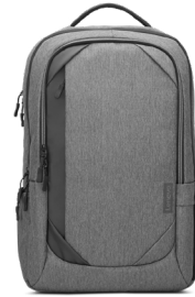
Lenovo Business Casual 17-inch Backpack