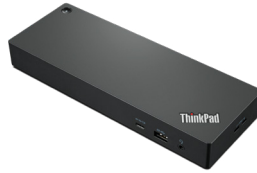
ThinkPad Universal Thunderbolt™ 4 Dock