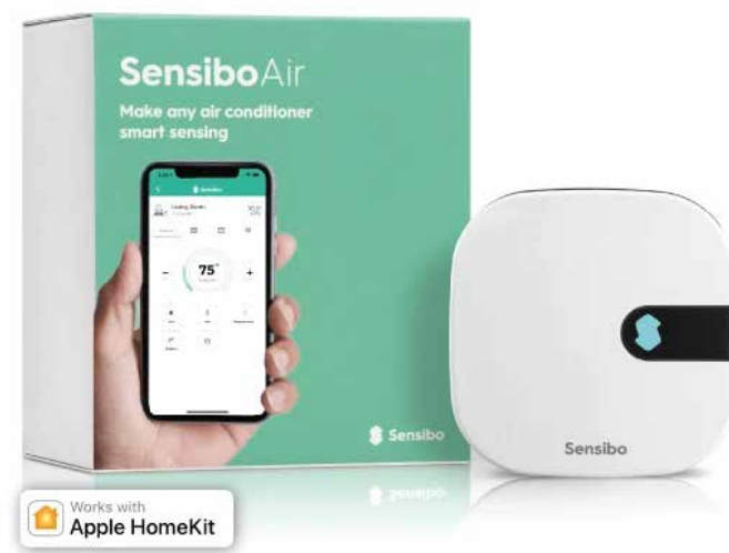
Sensibo Air stand alone