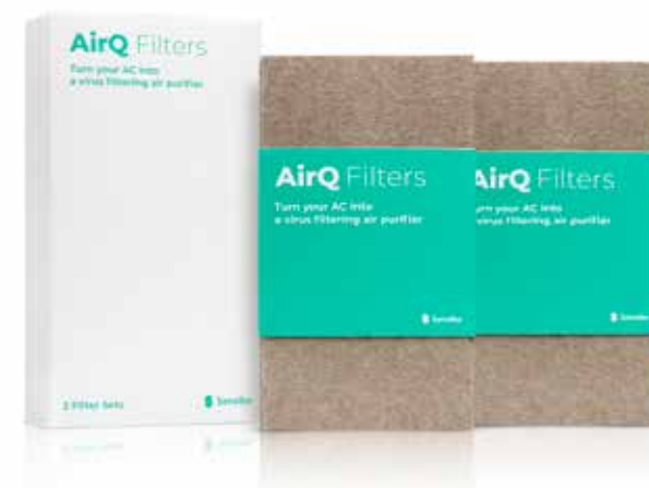
Sensibo AirQ Filters