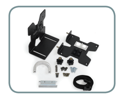
INCLUDED MOUNTING PADS AND STRAP INCREASE STABILITY