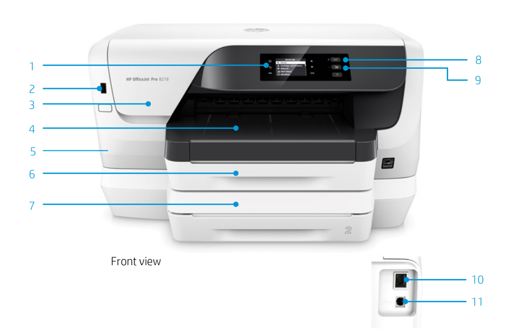
Rear I/O panel close-up