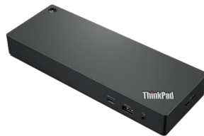
ThinkPad Workstation Thunderbolt™ 4 Dock