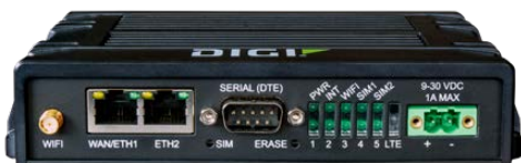
IX20 WITH GPS AND CELLULAR ANTENNAS