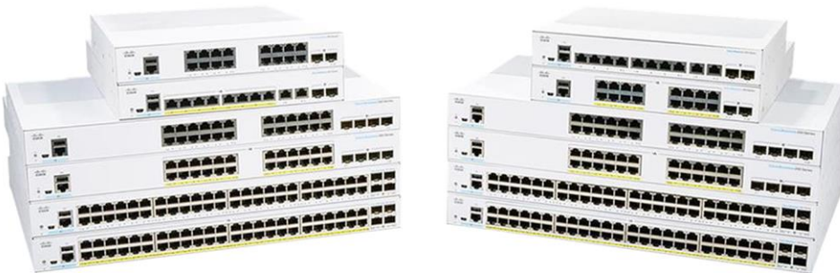
Figure 2. Cisco Business 350 series managed switches

The Cisco Business 350 Series Switches, part of the Cisco Business line of network solutions, is a portfolio of affordable managed switches that provides a critical building block for any small office network. Intuitive dashboard simplifies network setup, and advanced features accelerate digital transformation, while pervasive security protects business critical transactions. The Cisco Business 350 Series Switches provide the ideal combination of affordability and capabilities for small office and helps you create a more efficient, better-connected workforce. When your business needs advanced networking features and security for the digital transformation yet value is still a top consideration, you're ready for the Cisco Business 350 Series Switches.