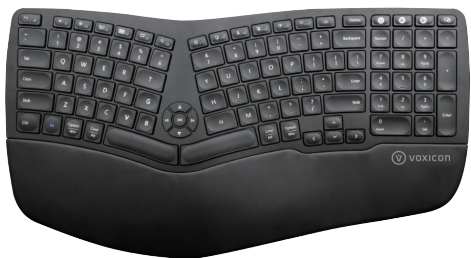
E902 Ergonomic Keyboard